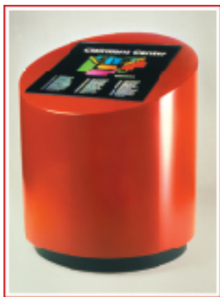
375 Illuminated Directory mounted into a custom fiberglass kiosk