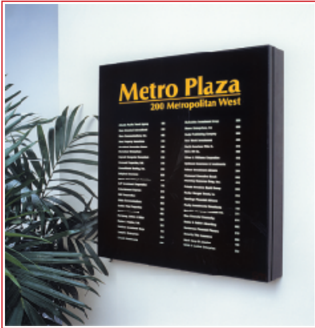
375A Illuminated Directory with 2 columns. Size 24" wide x 24" high x 3" deep.